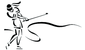
Birch Hills 56 Ladies Golf Club