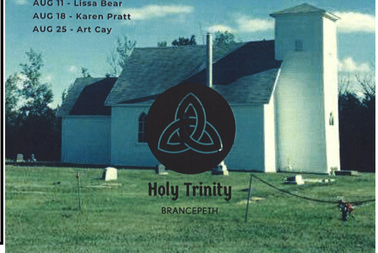
Holy Trinity BRANCEPETH

Faith only becomes real if we trust in God to help when we can't help ourselves. All of us get in over our heads at some point, and some days it happens several times before breakfast! The stories of our journey through hell to hope are the stories of our faith.