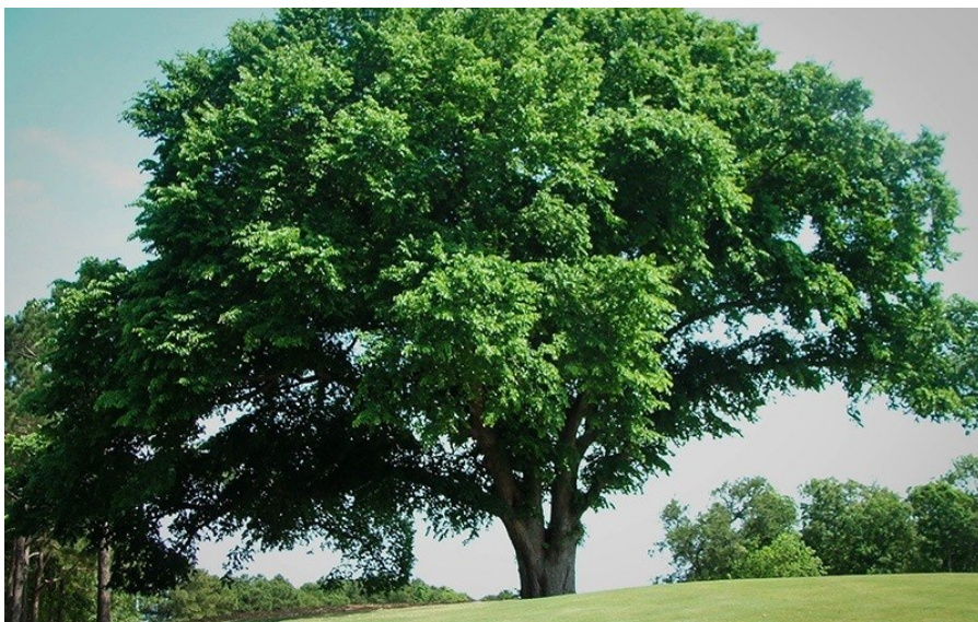
Ulmus (Elm) Tree

Please pour grease in an empty can and dispose in the garbage. Please only flush toilet paper down your toilet.