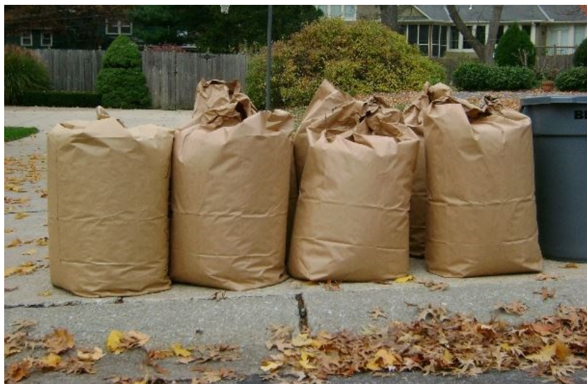
Spring Clean-up Week