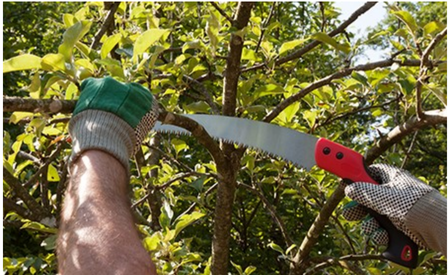
Ulmus (Elm) Tree

If there are questions regarding the regulations, please contact the Office.