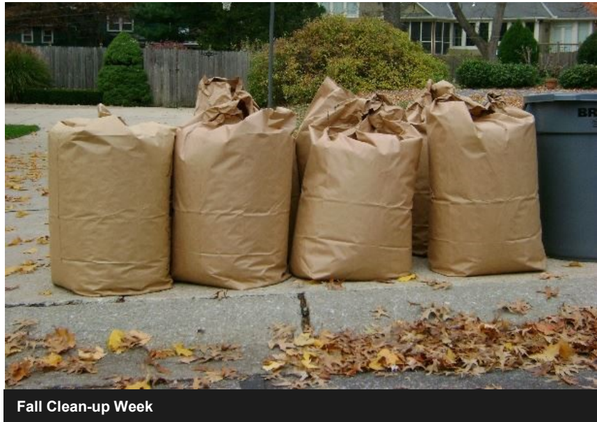
Fall Clean-up Week