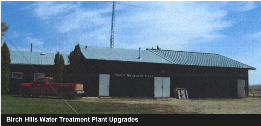
Birch Hills Water Treatment Plant Upgrades