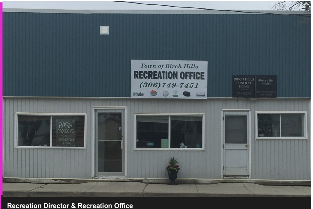
Recreation Director & Recreation Office

Even if you are addressing the Mayor and Council in your letter or report, and especially if you are asking for a decision to be made on a particular topic, you need to submit your correspondence to the Town Office so it can be added to the agenda so a motion of council can be made.