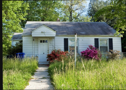
Abatement of Nuisance Property