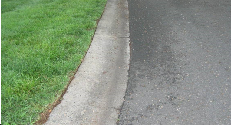
Poplar Subdivision Local Improvement