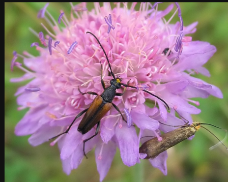
Field Scabious—Birch Hills