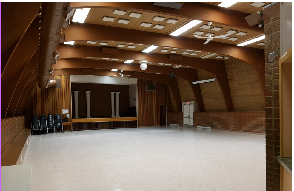
Civic Centre—Birch Hills

We also accept online bill payments through any Credit Union affiliate, CIBC, Scotia Bank and now TD Bank. We are actively looking into offering further bank options, please help by mentioning your interest in adding the Town of Birch Hills as a vendor to your banking institution.