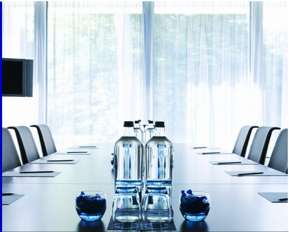
Municipal Council Meeting

Any trees that interfere with power lines may have to be trimmed by SaskPower. Please contact them at 1-888-757-6937 with any questions.