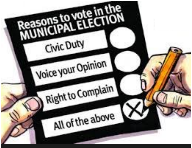
Vote on October 26, 2016