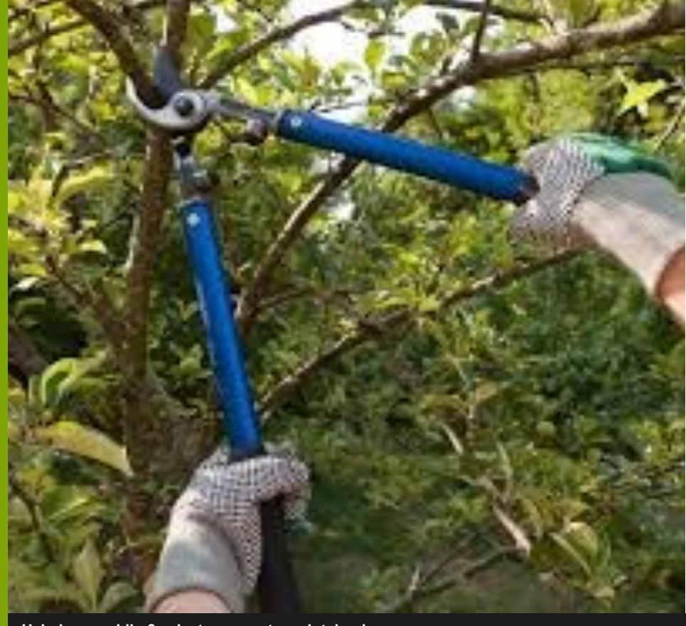
Help keep public & private property maintained

The database created when businesses are licensed with the Town will help establish our business directory that is in the process of being created. Please ensure your business license is current and the Town office has your most up to date information.