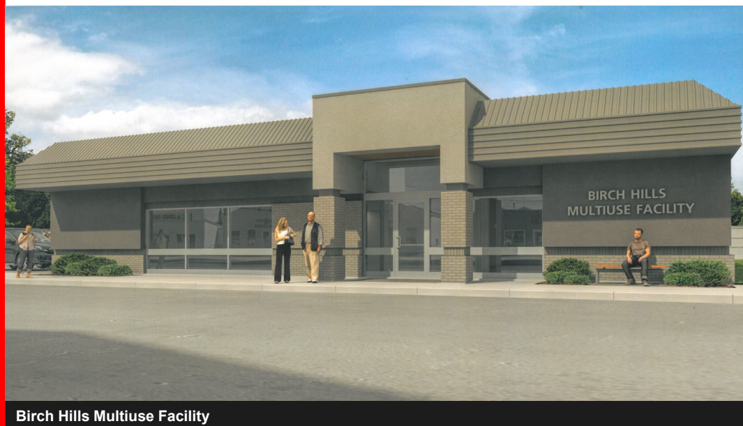
Birch Hills Multiuse Facility

Year end reminder letters have been sent. If they remain unpaid at the end of the year, they are considered arrears and 10% penalty will be added to any unpaid amount.